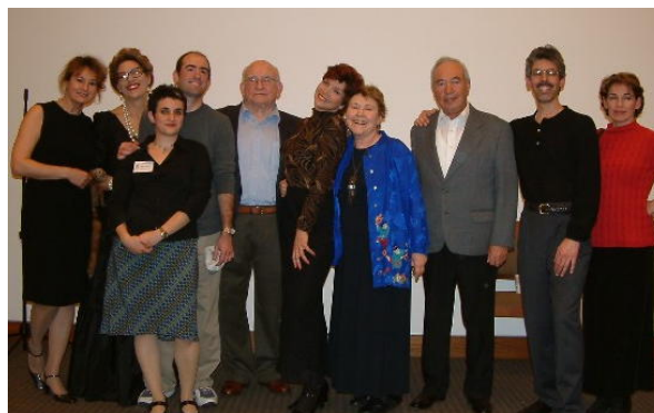
Ed Asner and the cast of "Mentshn"

The rich learning experiences offered by CIYCL inspire and empower individuals to become the activists, educators, artists, and writers who are needed to ensure that the Yiddish language survives and continues to be renewed.